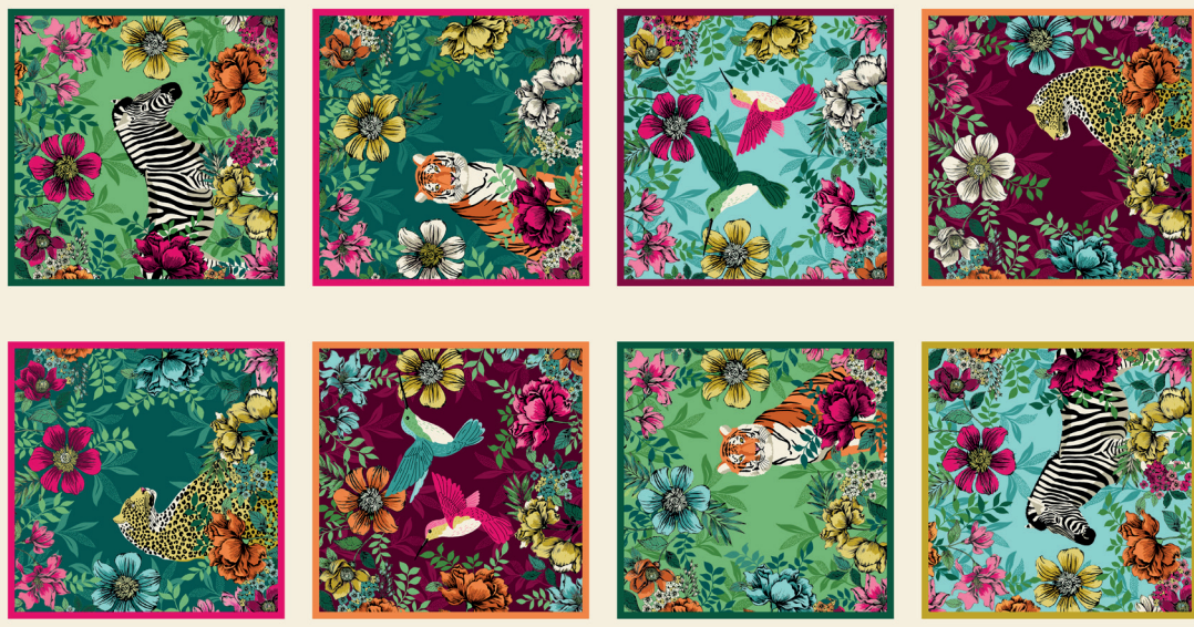
2429/1 Panel (actual size 24" x 44" / 60 x 112cms)