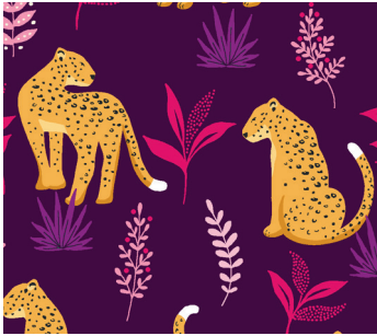
2425/P Cheeky Leopard